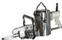
Electric Beef Brisket Saws