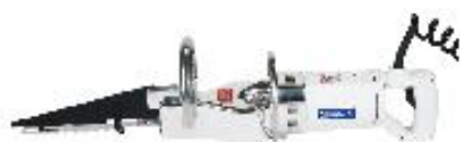
Reciprocating Breaking Saws