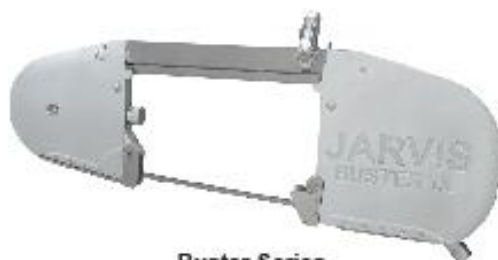
Buster Series Carcass Splitting Bandsaws