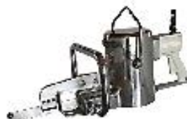
Electric Beef Brisket Saws