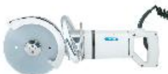
Circular Breaking Saws